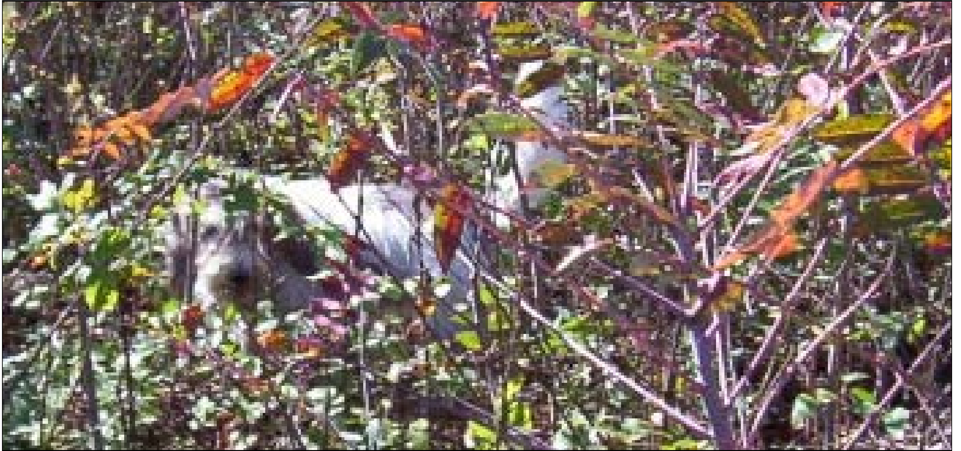
Puppy learning that dense cover yields wonderful smells