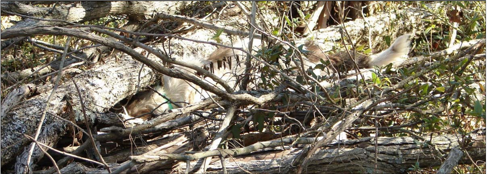
A long rib cage and keel protect in heavy brush