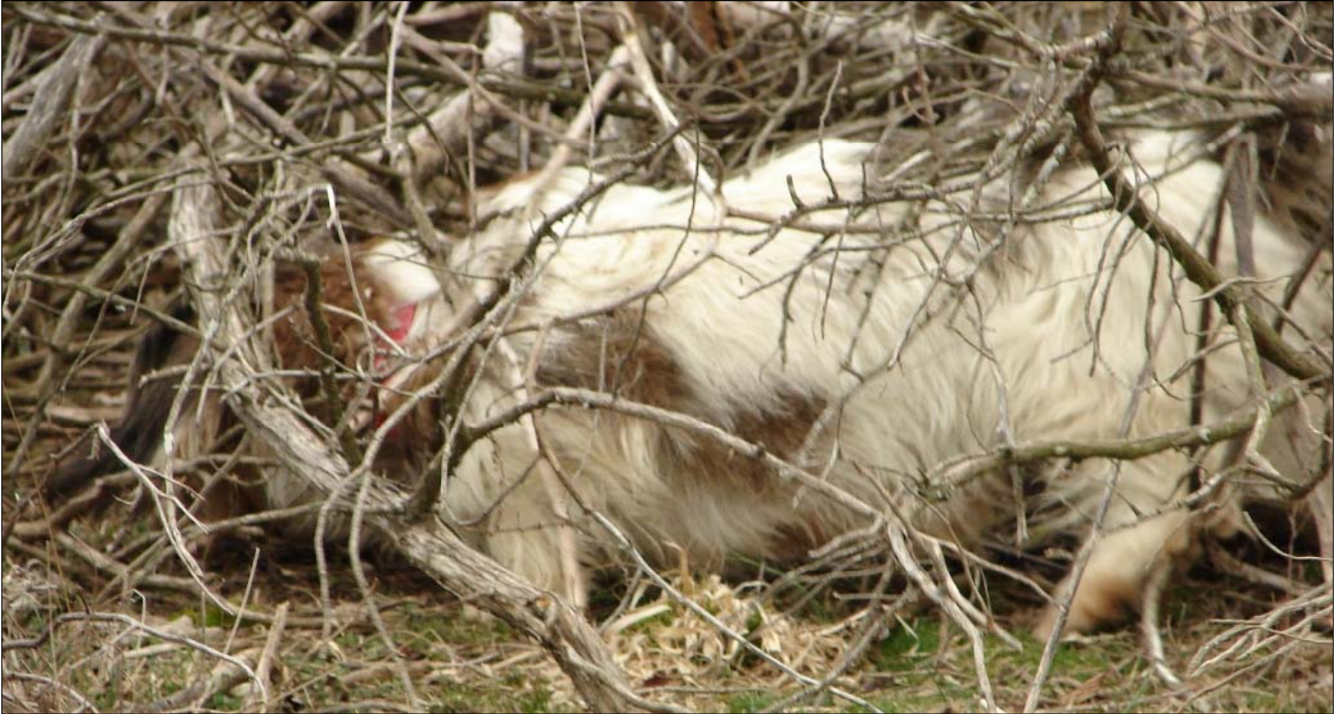
Ears brush the ground, stir the scent, and direct it to the nose