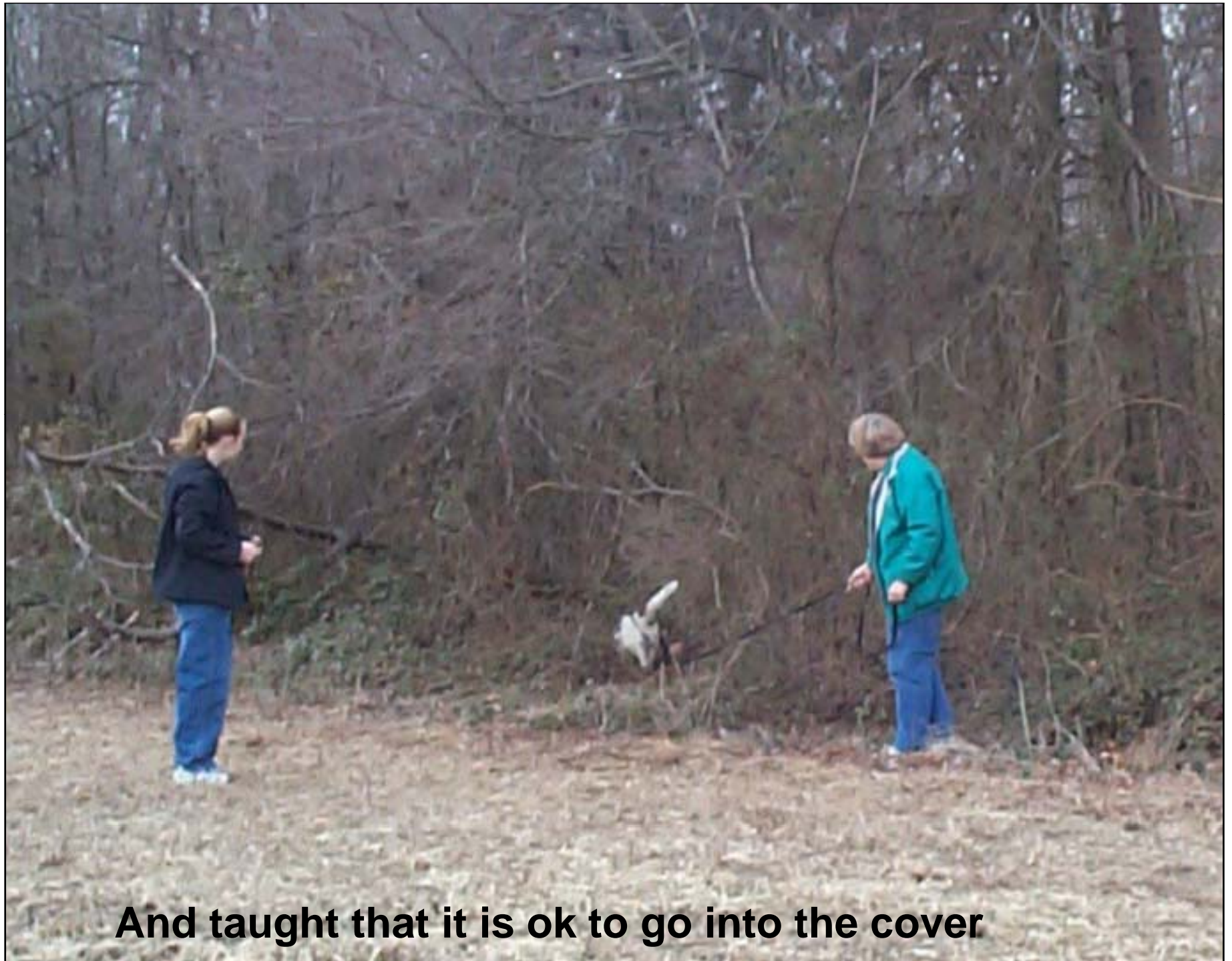
And taught that it is ok to go into the cover