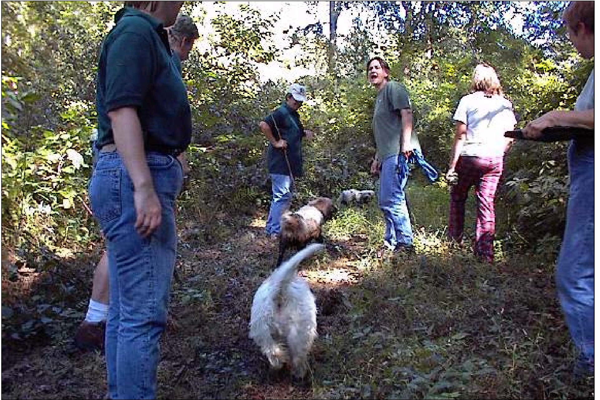
To the much larger Delsea running grounds in NJ