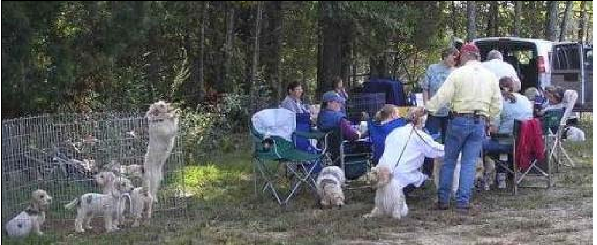
Both people and their PBGVs enjoy relaxing together