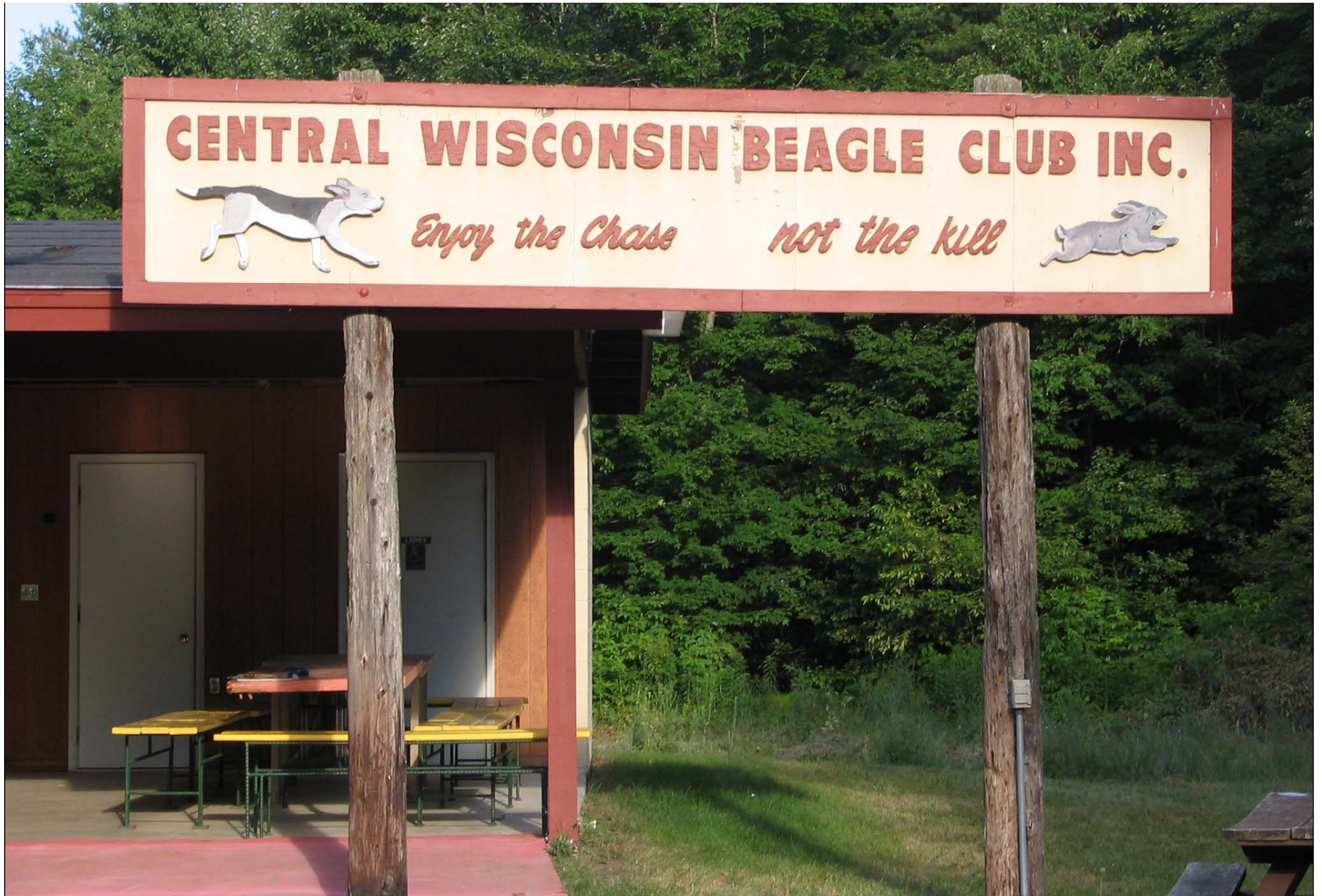
To the north woods of WI