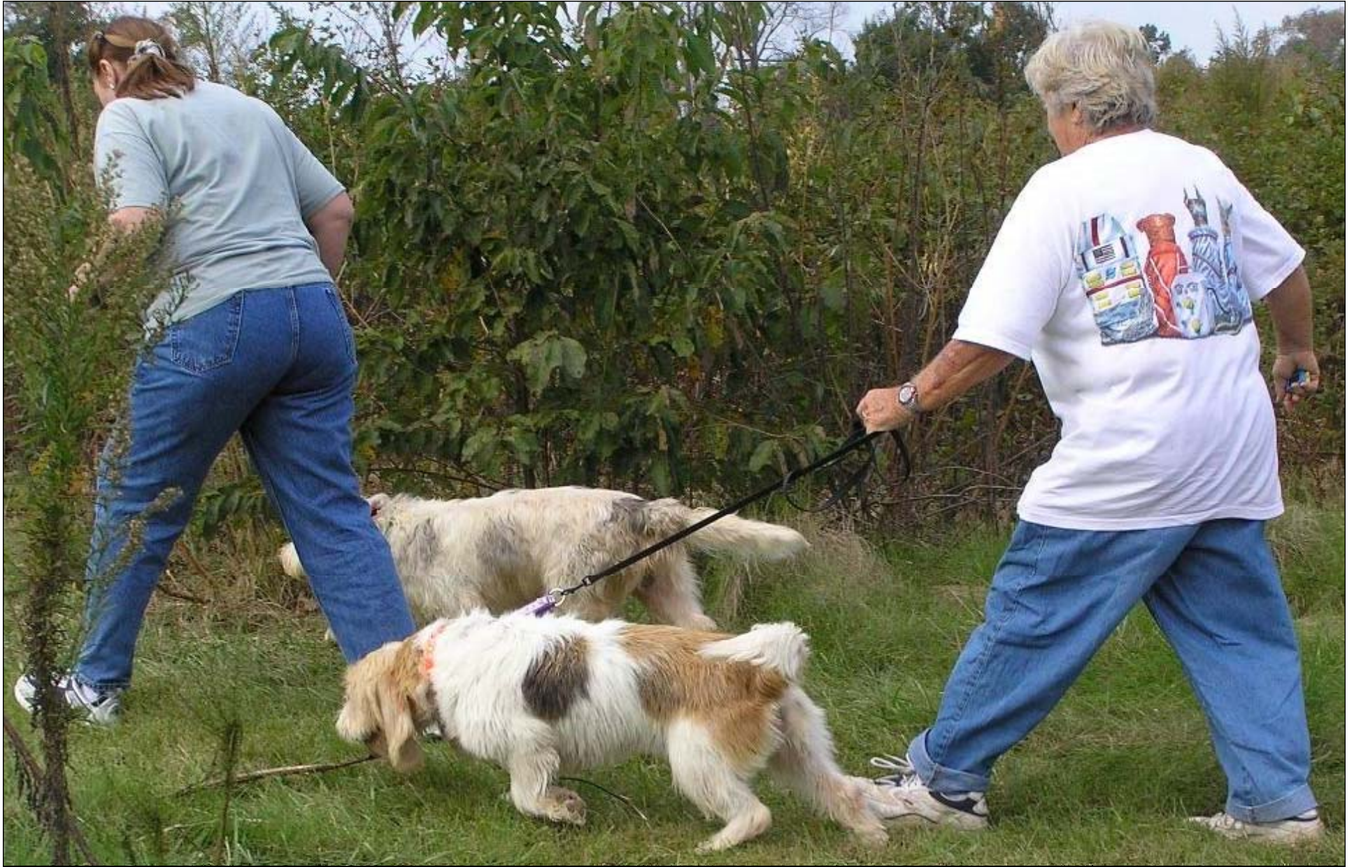
Two Grands heading out.