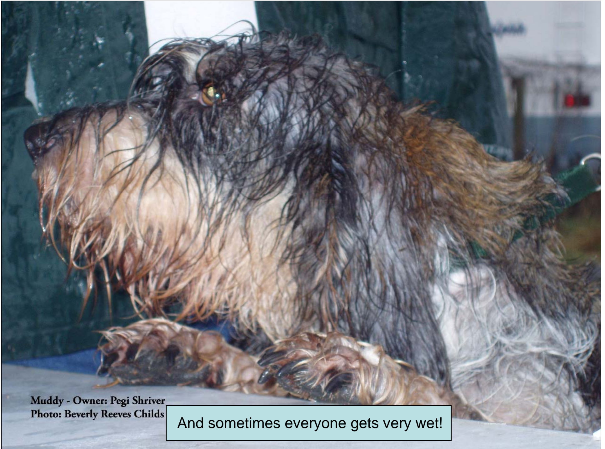
Muddy - Owner: Pegi Shriver