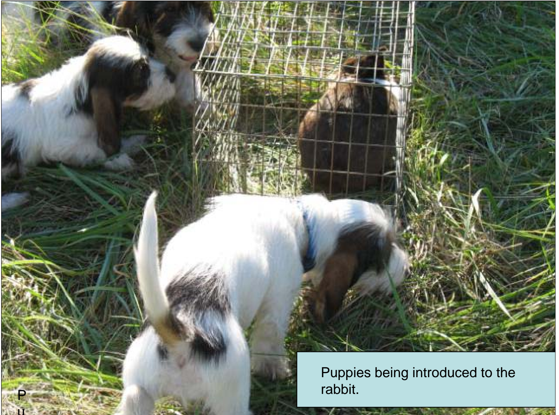
Puppies being introduced to the rabbit.