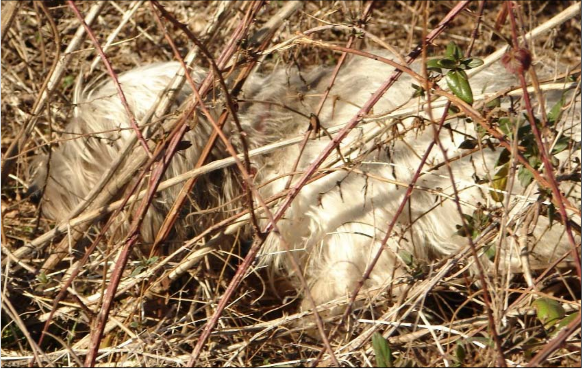
Briars are no problem