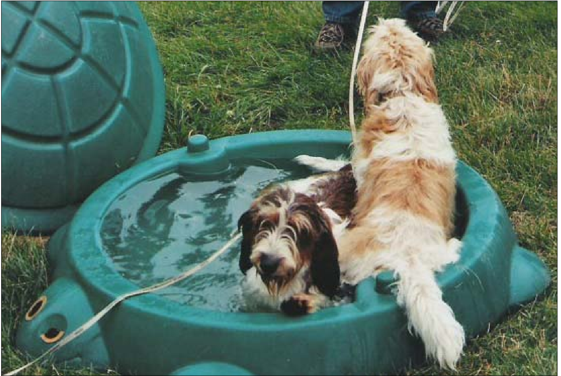
During the heat of late Spring or early Fall, cool down pools had to be provided