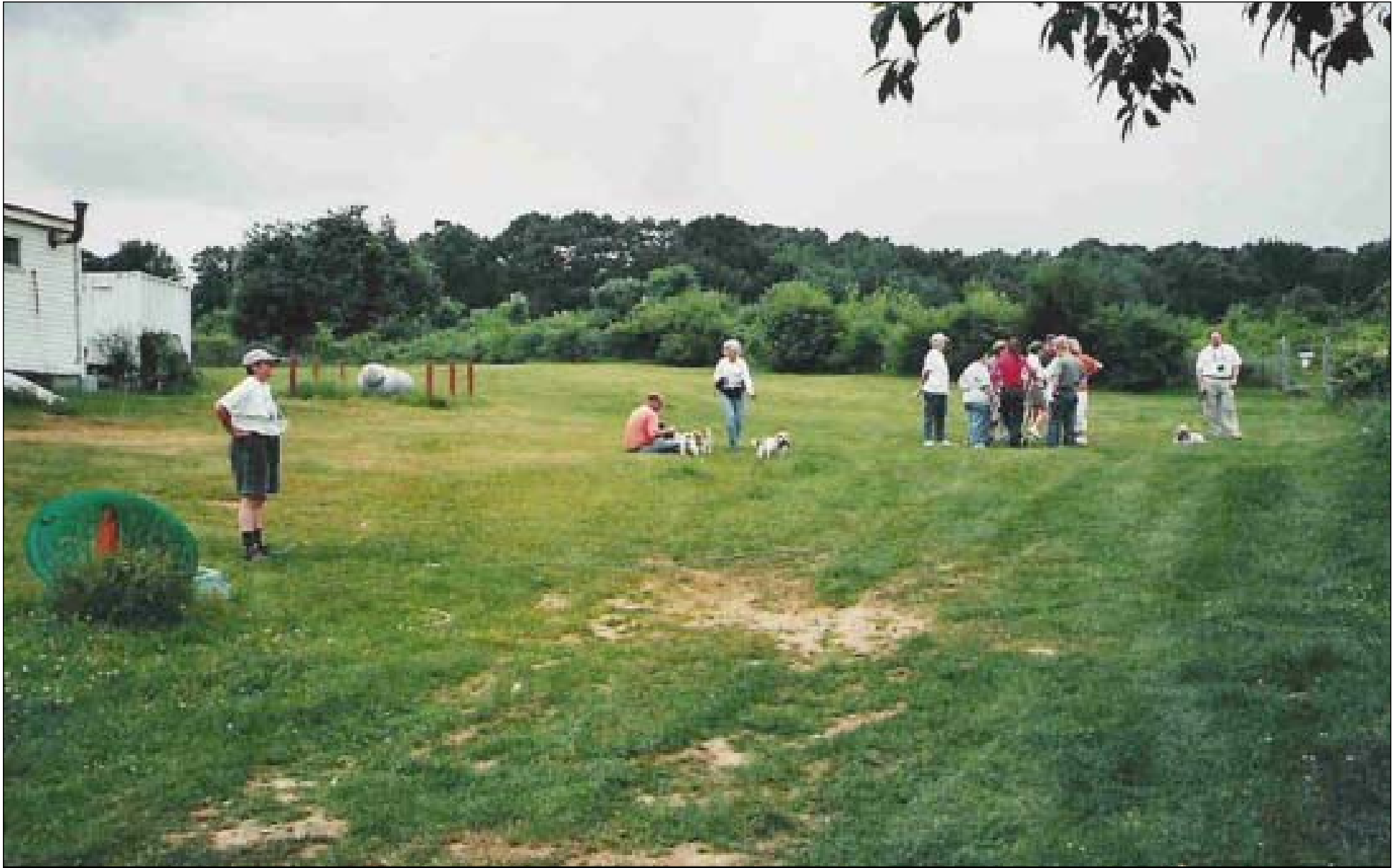
To the open fields of RI