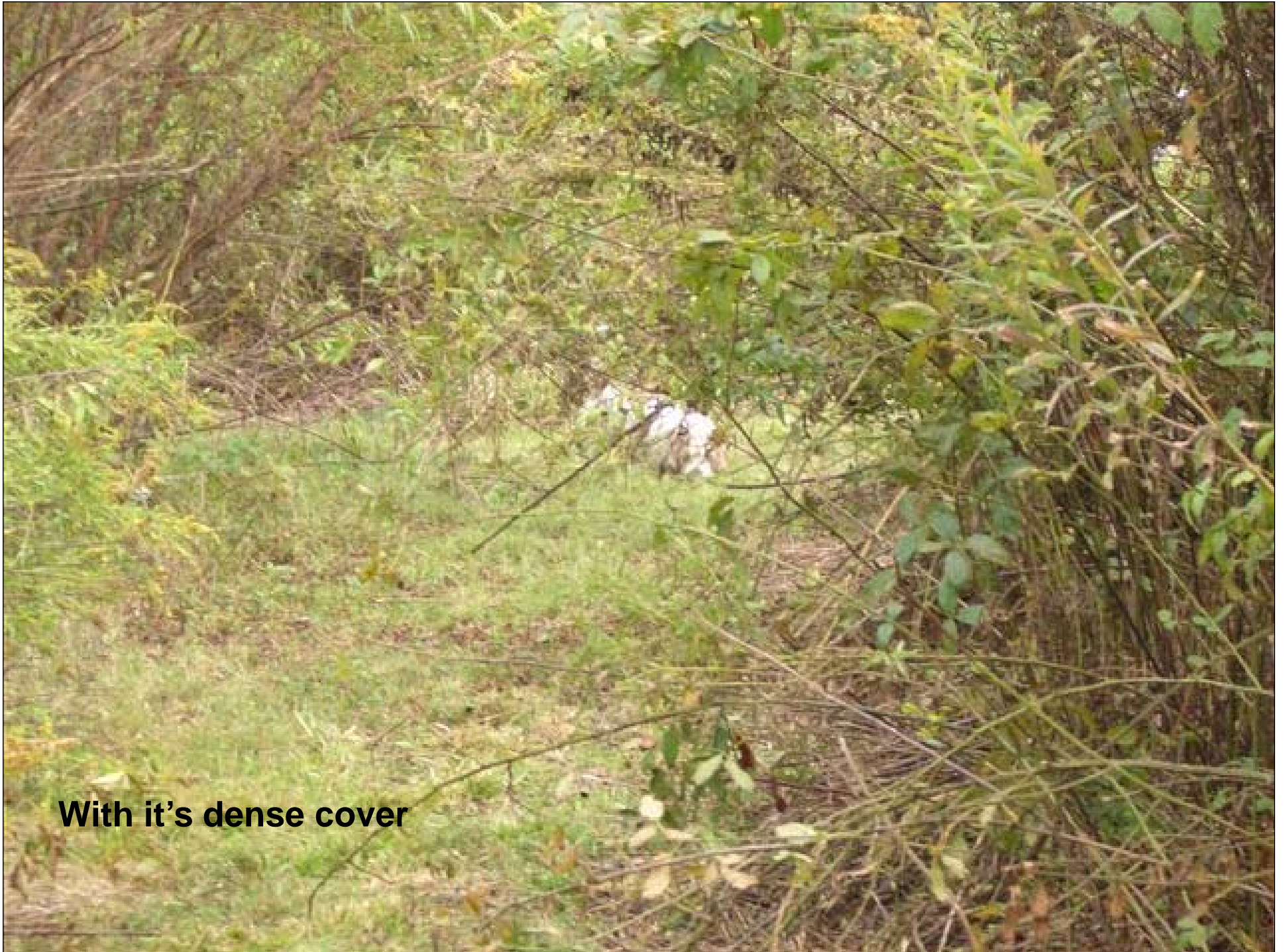
With it's dense cover